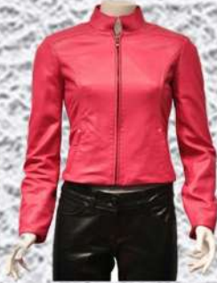
Female Leather Jacket