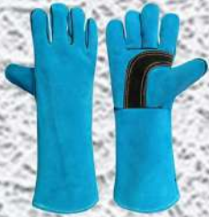
Leather Welding Gloves