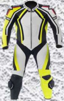
Leather Moto racing dress (TTP)

The major exported items of Pakistan Leather Garments/ goods include Jackets, Gloves, Hand Bags and Moto-racing garments.