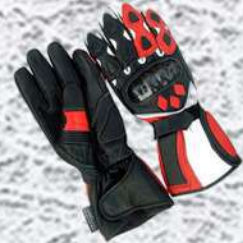
Leather Moto racing Gloves