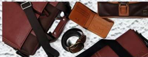
Miscellaneous Leather Accessories