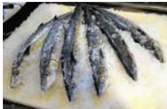
Frozen Mackerels/Sardines (HS303)