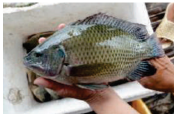
Tilapia Fish (HS303)