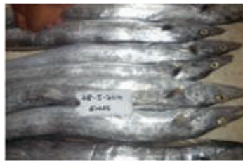
Fresh or Chilled Ribbon Fish (HS302)